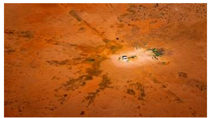
All tracks lead to water