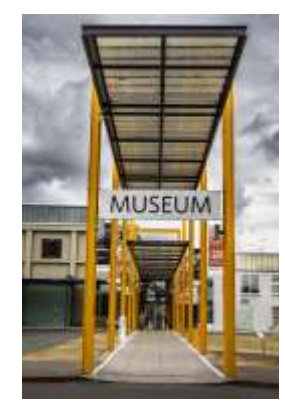
Queen Victoria Museum

City Park and Princes Square are cultured parks in the city centre. Both have photographic attractions. Macaque monkeys are a feature at City Park along with the conservatorium (where I was married), band rotunda, flowering beds and grand old trees. Albert Hall, constructed in 1891 to house the Tasmanian Industrial Exhibition of 1891-92, is also a feature of the park. It is one of Launceston's many heritage buildings.