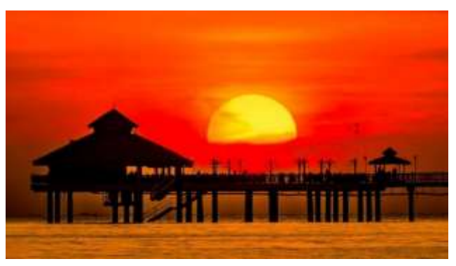
image that I exposed for the sun which meant the jetty would be in silhouette. The image was processed in Lightroom and the three silhouette birds were added in Photoshop to help balance the composition.

The image was captured from Pantai Kok beach in Langkawi, Malaysia. I scouted the area for a couple of hours and then waited for the sun to set. With the use of the PhotoPills planner app, I was able to position myself in the best location to capture the sunset. The location happened to be on a rocky point south of Pantai Kok beach. Due to the distance between myself and the jetty (approx. one klm) I used a telephoto zoom lens to capture the images. The benefit of using a long telephoto lens meant the setting sun appeared quite large. I waited for the sun to set just above the jetty, and I started to shoot bracketed exposures to preserve highlight and shadow details. Since this is a silhouette theme, I only used the one