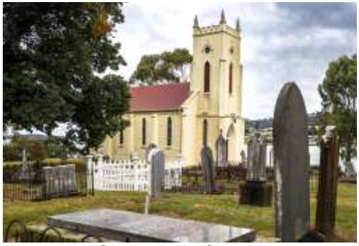
St Mathias's Church

walking distance of the city centre, The Basin represents cultured