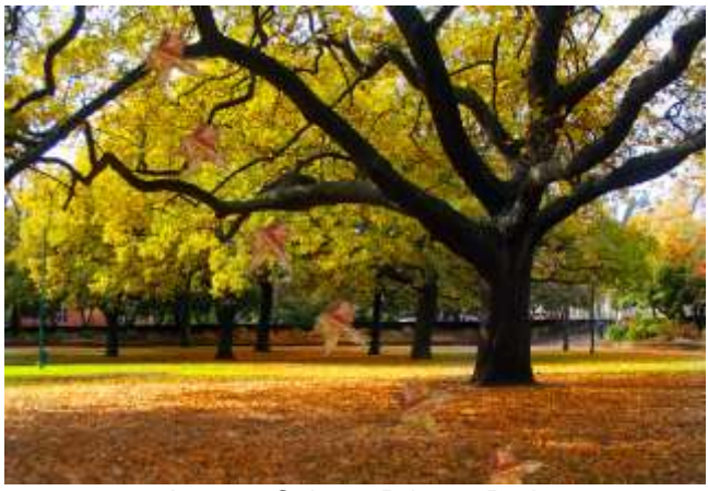
Autumn Colours Princes Park