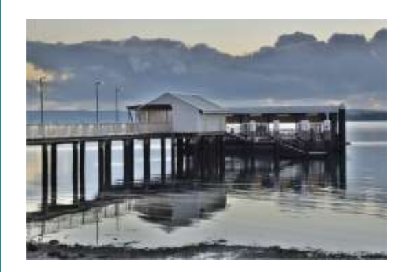
Victoria Point Photo Shoot Gwenda Kruger