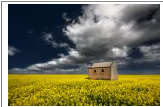
Canola under a southern sky by lan Sweetnam received an acceptance in Salon of Excellence 2020

Salon of Excellence is hosted by different clubs each year under the banner of Photographic Society of QLD (PSQ). This is open only to QLD clubs and is a low cost to enter so it is a good one to start entering competitions. This is an individual comp with an award for the club with the highest score from