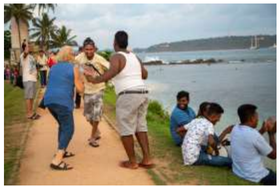
Sri Lankans and tourists in Galle

Nuwara Eliya for a day or two. Visit a tea factory and have high tea at The Grand Hotel which the British had built to remind them of England. Visiting the Horton Plains, a windswept mountainous area with waterfalls, offers many photographic opportunities. Proceed to Ella, which is a very popular tourist destination.