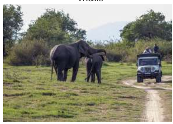
Wild elephants at Minnariya

plan the timing of their visits. Ancient man-made lakes which are used for irrigation can be seen as small oceans. It is rewarding to walk through