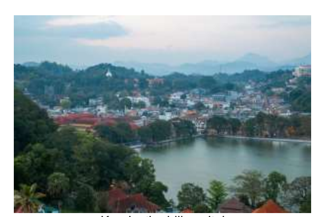
Kandy, the hill capital

Take the train from Kandy to Muskeliya, a very scenic ride to the mountains with tea estates and farms. Stay at