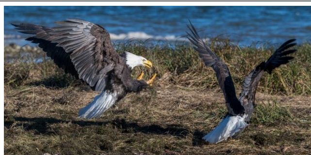
Honour – I Want Your Salmon – Jefferey Mott