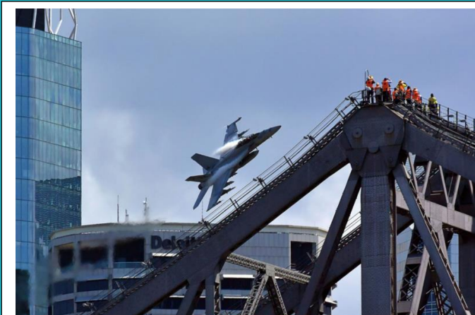
Digital Image of the Month – Robert Macfarlane “Cross City Plane Lane”