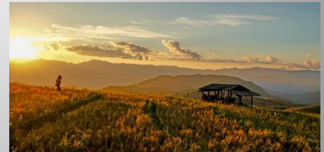
Julie Looking for the Light, Thailand