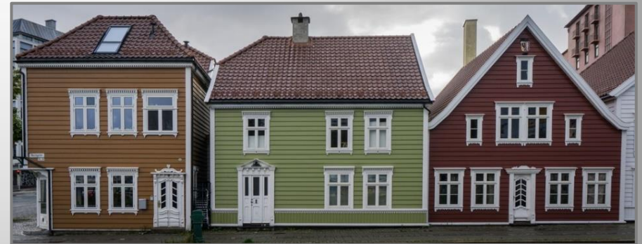
Houses, Bergen, Norway