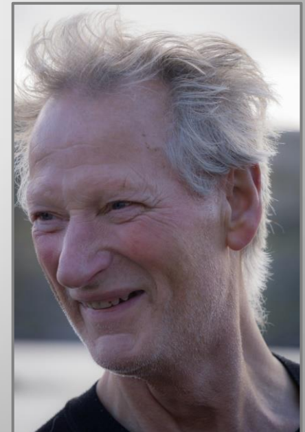
Norwegian fisherman, Skarsvag, Norway

To be Continued.