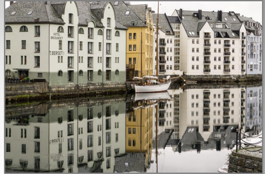
Reflections in Alesund, Norway

As photographers, you will no doubt want to know about gear. I took my Sony A6000 with kit lenses 16-50mm and 55-210mm. Body, battery and both lenses weighed in at 750gm. I took a gorillapod and lots of cards. That's it! Worked like a dream, and I plan to do the same on an upcoming seven week Asian trip in March/April this year.