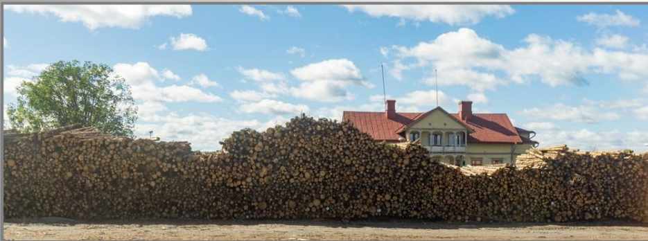
Timber, rural Sweden