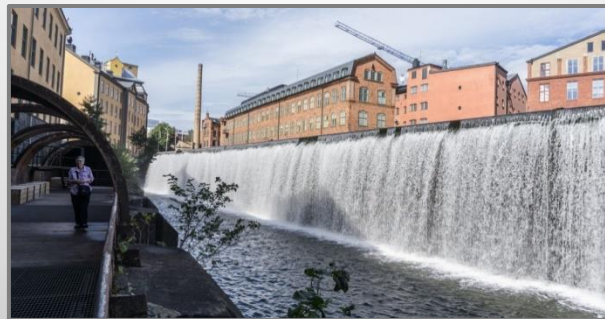
Post industrial landscape in Norrköping, Sweden

Norway is the most expensive country in the world to live in and Sweden is not far behind, so if you are planning to visit, plan carefully. Pre-book and pay for everything where you can so you don't have to have your hand in your wallet all the time. Public transport is excellent – use it.