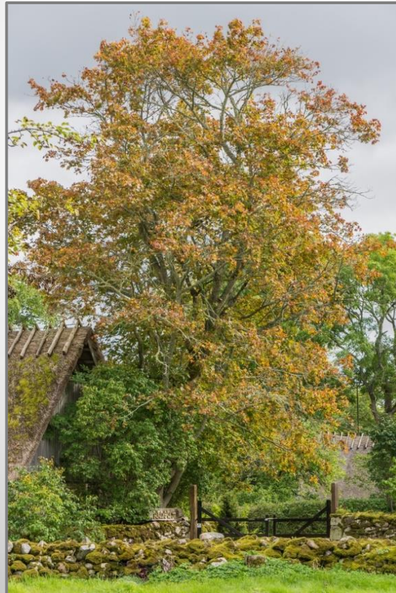
Fishing village in rural Estonia

Not a great deal is widely known in Australia about the Baltic States - indeed in the west in general. Always being a great fan of the road less travelled, that is a great reason for me to go and find out for myself.