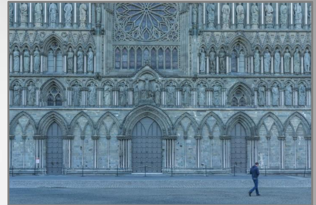
Nidaros Cathedral in Trondheim, Norway

hours under the northern lights, but I am not going to share the image with any other photographer because a 30 second exposure on the decks of a moving boat is somewhat less than technically perfect!