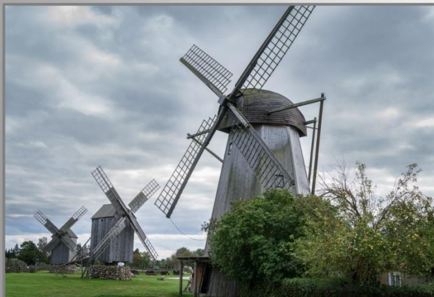
Windmills, rural Estonia

When the ship arrived back in Bergen (in the subarctic) the locals were complaining of a heatwave and I spoke to a young couple who were swimming their dog in a fountain in the local park because it was feeling the heat. It was a whole 16 degrees and I still had my down jacket on (admittedly with the zip undone, for once!).