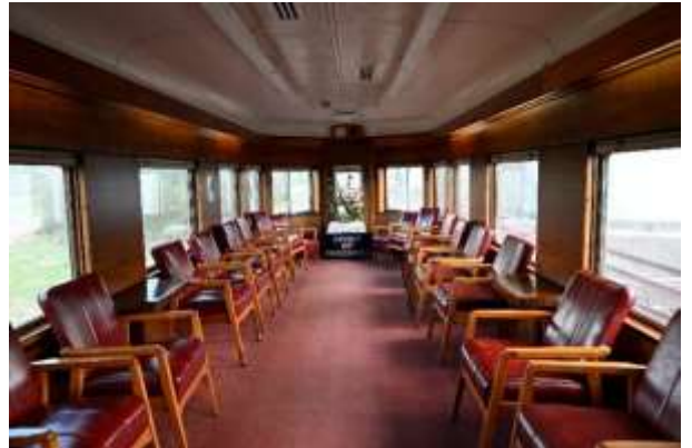
Spirit of Progress Parlour

We were on the Spirit of Progress through to Melbourne for an overnight stay. We were then back on the Spirit of Progress in the morning all the way to Horsham Vic where we had an overnight stay and dinner at the pub. Next morning we visited the historic Stick Shed. We then returned to Murtoa Station to reboard the Spirit of Progress again and travelled on to Sheep Hill to view silo art before returning to Horsham.