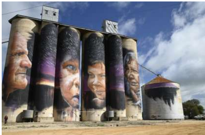
Brim Silo Art