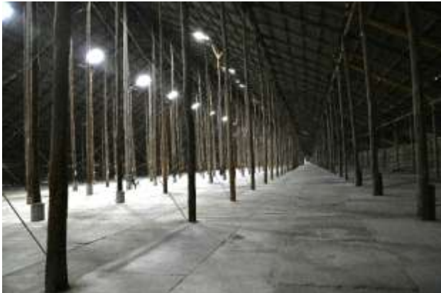
Stick Shed at Murtoa

We then travelled further on to Tumut to have a fantastic lunch of great pizzas at a brewery . A couple of hours after lunch we stopped again at a country pub at Walwa for drinks. After this stop it was off to Albury where we met up with the Heritage train the Spirit of Progress. It was now time to sit back and relax and enjoy the countryside.