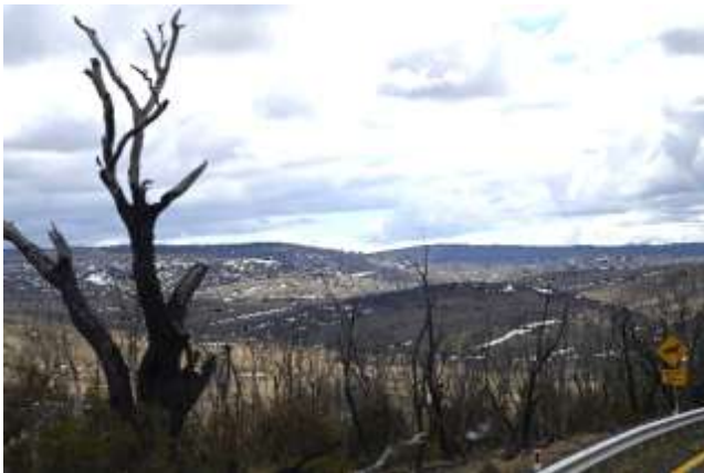
View from Snowy Mountains

We continued still by coach at this stage, heading for Tumut, via the Snowy Mountains Highway. The scenery here is beautiful, and although very much in the distance, I got to see Brumbies. You will notice to the bottom right of this photo is the sign, beware of brumbies. And the next photo shows the brumbies grazing.