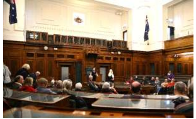
House of Representatives

After two nights in Canberra, we headed for Cooma and Tumut. We stopped at the old Cooma Railway Station for a delicious morning tea on the old platform. I think the temperature that morning was about 10 deg.