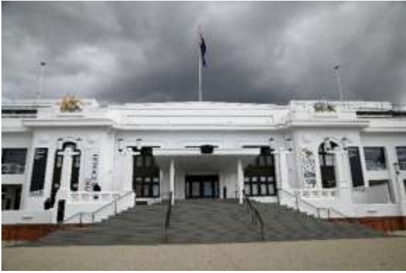
Old Parliament House