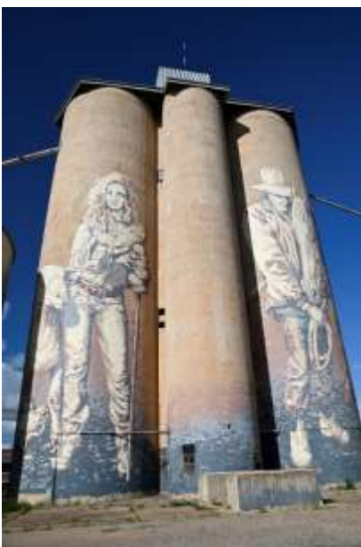
Sheep Hill silo art

We were on the Spirit of Progress through to Melbourne for an overnight stay. We were then back on the Spirit of Progress in the morning all the way to Horsham Vic where we had an overnight stay and dinner at the pub. Next morning we visited the historic Stick Shed. We then returned to Murtoa Station to reboard the Spirit of Progress again and travelled on to Sheep Hill to view silo art before returning to Horsham.