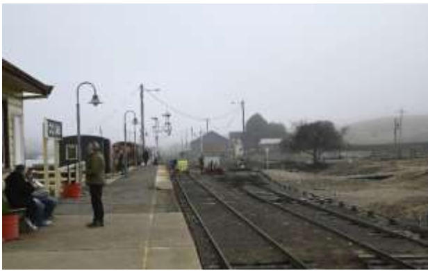
Old Cooma Railway Station

After two nights in Canberra, we headed for Cooma and Tumut. We stopped at the old Cooma Railway Station for a delicious morning tea on the old platform. I think the temperature that morning was about 10 deg.