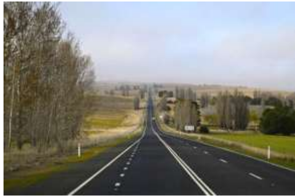
Monaro Highway (A23) to Cooma

Travelling down the Monaro Highway brought back lots of memories of Sunday drives to Cooma. Believe it or not, in all the time we lived there, I only went to the snow three times.